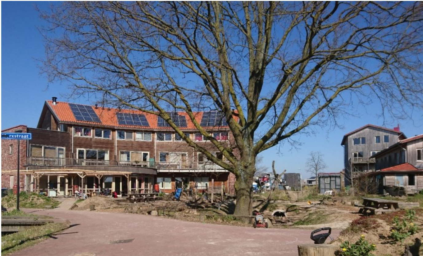
Lent Nijmegen, Gelderland, Netherlands