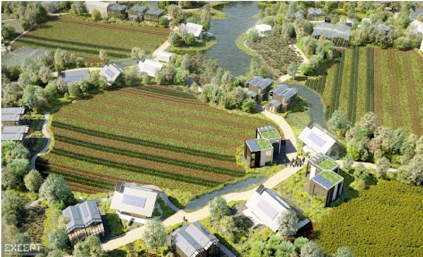
Almere Osstewold, Flevoland, Netherlands