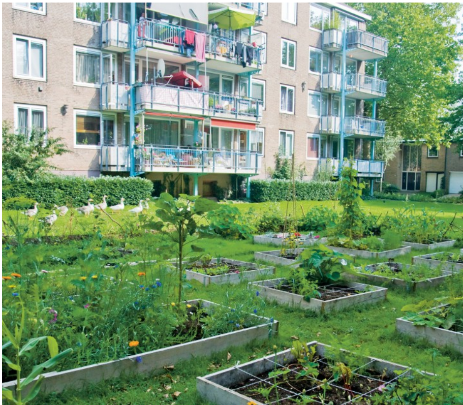
Delft, Zuid Holland, Netherlands