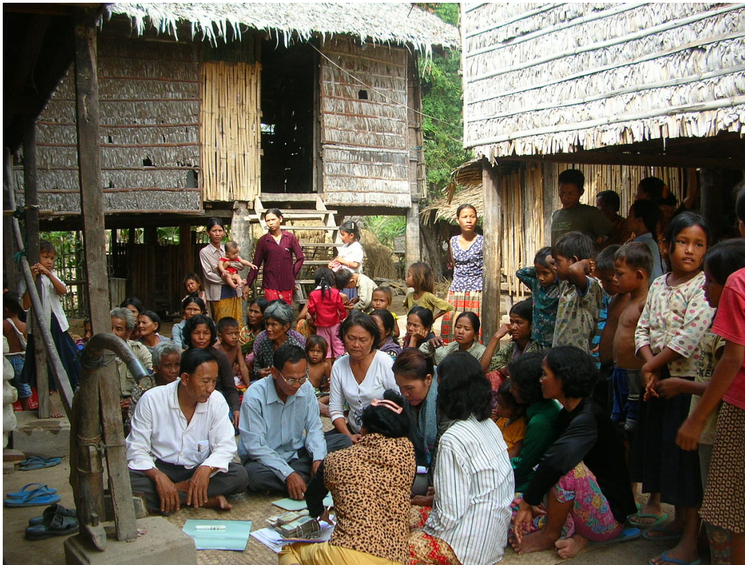
Illustration: Takeo province, Cambodia